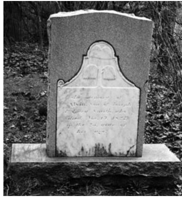
Alvin Smith grave marker, Swift Cemetery, Palmyra, New York. The inscription reads, "In memory of Alvin, Son of Joseph and Lucy Smith who died Nov. 19, 1823, in the 25 year of his life."