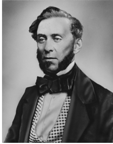
Samuel Brannan.

Over the signatures of Brigham Young and Willard Richards, Brannan was “disfellowshipped and cut off” for conduct that was a disgrace “in the eyes of justice and virtue.” The charges against Brannan went beyond overreaching his stewardship. As Young and Richards saw the situation, Brannan, “under the sacred garb of religion, [had] been practising the most disgraceful and diabolical conduct.” 31