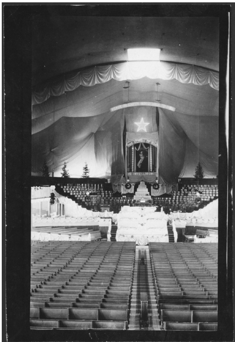
FIGURE 1. Salt Lake Tabernacle, December 1905, The Latter-day Saints celebrated the one hundredth anniversary of Joseph Smith's birth in December 1905. Joseph F. Smith, the Prophet's nephew and sixth President of the Church, dedicated a granite memorial at Joseph Smith's birthplace in Sharon, Windsor County, Vermont, on December 23, 1905. On the following day, twenty thousand Latter-day Saints gathered in the historic Salt Lake Tabernacle in two meetings to remember the Prophet. This photograph highlights a view of the interior of the Tabernacle, decorated for the centennial celebration of the Prophet's birth. The bright light in the ceiling comes from the skylight.