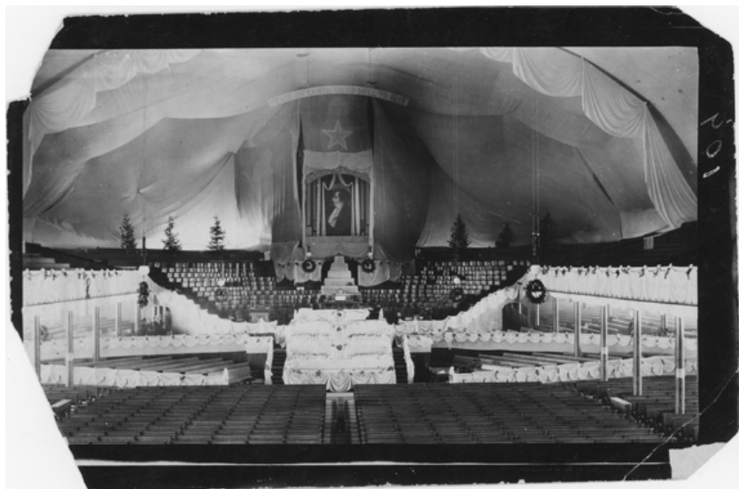
FIGURE 6. Interior view of the Salt Lake Tabernacle looking west, decorated for the centennial celebration of the birth of the Prophet Joseph Smith (6.1 cm × 4.2 cm, contact print), 1905, in private possession.

with silver stars which dazzled in the everchanging light, and on the right of the organ was a large electric star, emblematic of the star of Bethlehem. On the front of the organ, electrically illuminated, were the words, 'The Glory of God Is Intelligence,' the Sunday-School motto, and high up, suspended from the ceiling, was emblazoned the sentiment of the season, 'Peace on Earth, Good Will to Men.' Festoons decked with evergreens and holly were swung around the choir and speakers' stand, and the front of the entire gallery was draped with white, this being the prevailing color. From the arc lights hung large wreaths. In the center of each were large red Christmas bells, and the effect produced was a particularly brilliant one." 63