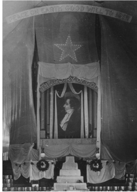
FIGURE 5. Detail of figure 6, interior of the Salt Lake Tabernacle, highlighting the illuminated electrical lights of the “Star of Bethlehem” and the scriptural phrases “Peace on Earth Good Will To Men” and “The Glory of God Is Intelligence.” In private possession (see fig. 6).

The organ front was beautifully draped with light blue and on the ceiling of the west end of the building, immediately over the choir and the speakers’ stand, was spread a canopy of the same material studded