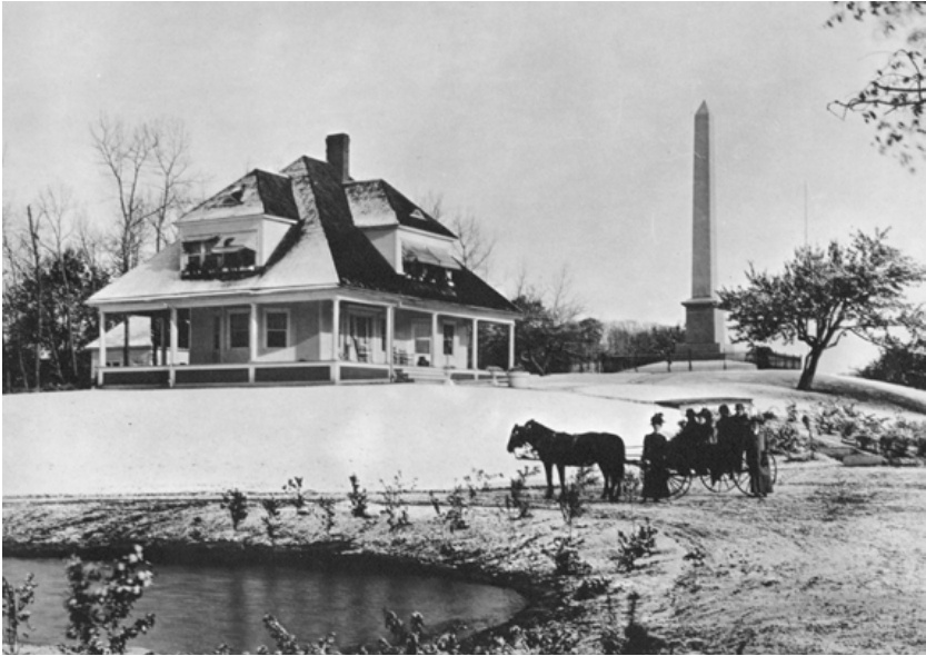
FIGURE 2. Joseph Smith's birthplace, Sharon, Vermont. In commemoration of the Prophet's one hundredth birthday on December 23, 1905, President Joseph F. Smith traveled to the Solomon Mack farm to dedicate the Joseph Smith Memorial Cottage (left) and a granite monument (right).

underscored the importance of the celebration this particular year by inviting all Church members to participate in special services to honor the Prophet throughout the Church on Sunday, December 24, 1905.