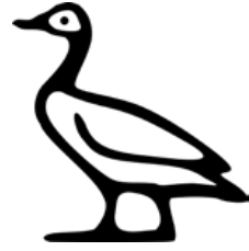
FIGURE 1. The Egyptian pin-tailed duck hieroglyph indicates filiation and can mean "descendant of." It is known as G39 in Gardiner's sign list of Egyptian hieroglyphs. Alan Gardiner, Egyptian Grammar: Being an Introduction to the Study of Hieroglyphs , 3d rev. ed., repr. (Oxford: Griffith Institute, Ashmolean Museum, 2001).

G39 denotes filiation and can bear the meaning "son of/male descendant of" or "daughter of/female descendant of." In Egyptian orthography, while G39 indicates filiation, the hieroglyph that follows it indicates the gender. Thus, when G39 is paired with the seated-man hieroglyph (known as A1), the pair means "son of." When G39 is paired with B1, the seated-woman hieroglyph, and the feminine ending t (represented by an image of a small loaf of bread, X1 in Gardiner's list), the interpretation is "daughter of" (fig. 2). 3 (This latter construction is not explored in detail in this article because there are no female names in the Book of Mormon that appear to incorporate G39). The G39 hieroglyph may have been pronounced za or sa , and the pronunciation of this morpheme is rendered as z 3 or s 3 ( z 3 or s 3 in some Egyptian transliterations). 4 C. Wilfred Griggs confirms the filial use of hieroglyph G39, noting that Egyptologist Raymond O. Faulkner verifies both the phonological and semantic readings. 5 Sederholm thus