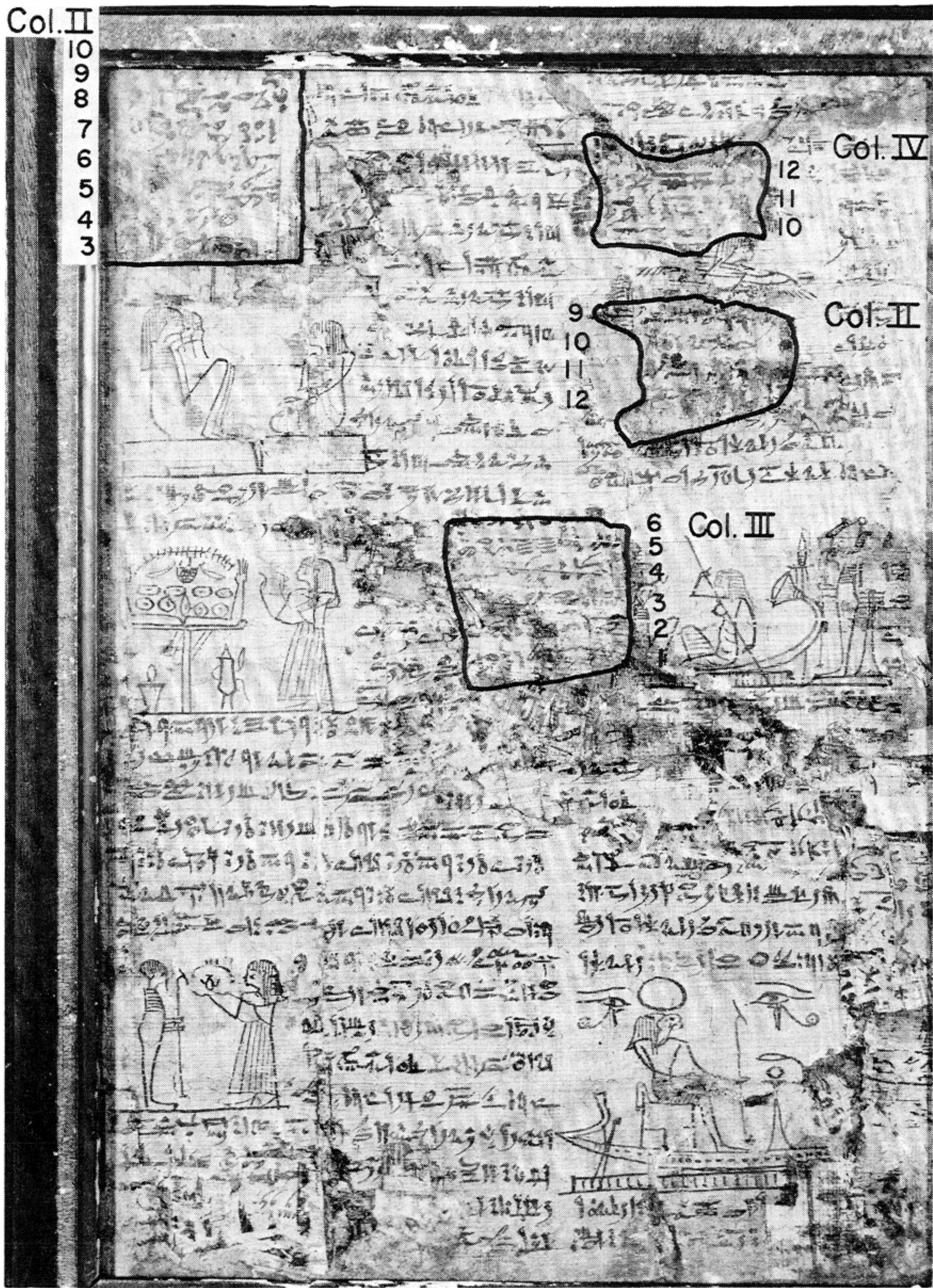
Joseph Smith Egyptian Papyrus No. IV. The outlined sections which were glued onto this Papyrus fit into Papyri X and XI to supply substantial parts of the damaged lines.