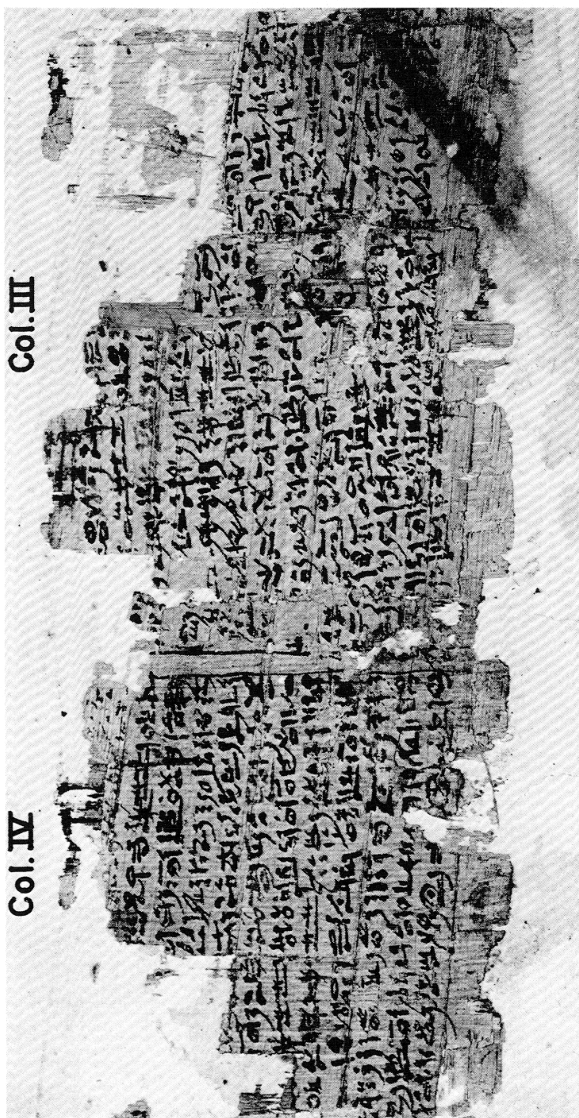
Joseph Smith Egyptian Papyrus No. X