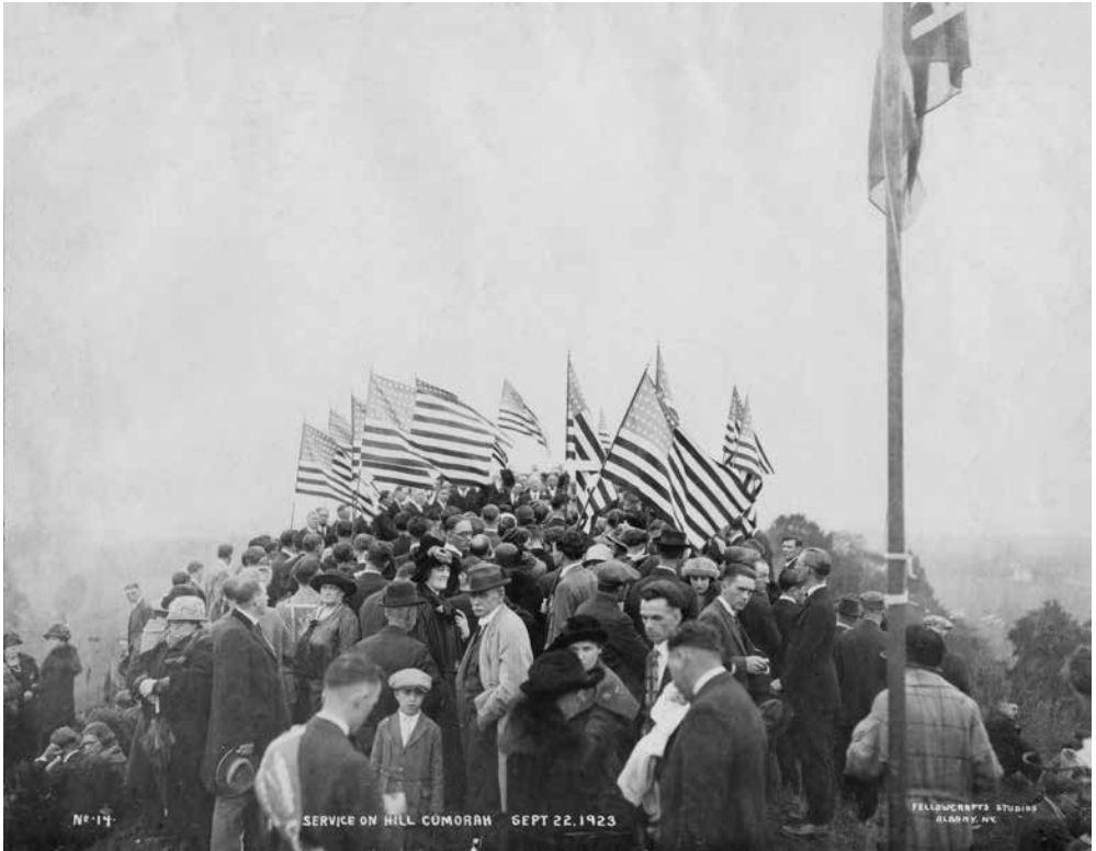
Centennial service on top of the Hill Cumorah, Manchester, New York, September 23, 1923.