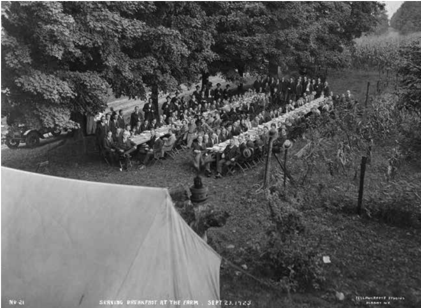
“Serving Breakfast at the Farm” to Eastern States missionaries and Church members, Smith farm, Palmyra, New York, September 23, 1923.

afternoon, followed by an opening dinner held on the evening of Friday, September 21. 75 Later, missionaries and members poured into the large tent for the first of the weekend’s meetings—a commemoration of the angel Moroni’s first visit to Joseph Smith one hundred years earlier. Two hymns were sung celebrating the angelic visitation, and the group was formally welcomed to the special conference. Before the meeting closed, the missionaries were invited to report on their summer proselyting labors. 76 Overall, the body was made “comfortable and pleasant” by the enclosed tent shielding them from the constant dribble of rain. 77