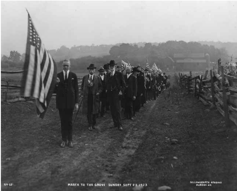
Church leaders and missionaries march to the Sacred Grove, Palmyra, New York, September 23, 1923.