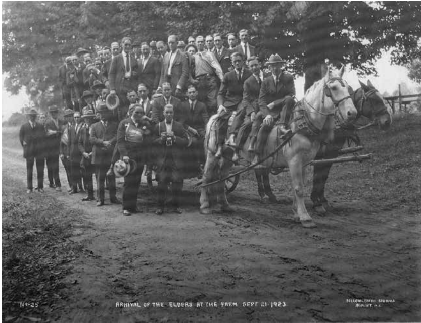
Arrival of the Eastern States Mission elders at the Smith Farm, Manchester, New York, September 21, 1923.

commemorate the centennial of an event that took place on that self-same hill one hundred years earlier in 1823.