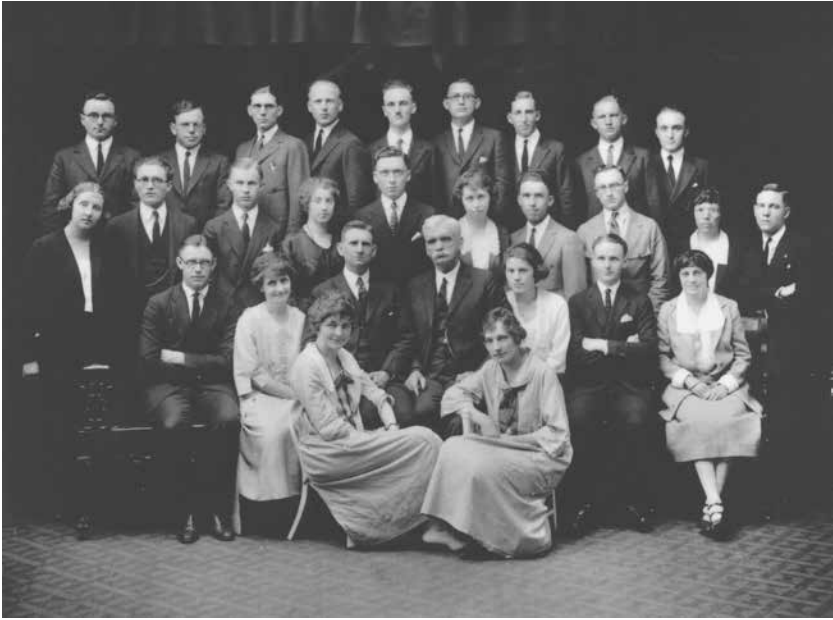
President B. H. Roberts with Eastern States missionaries, Brooklyn, New York, June 1922.

largely considered antiquated; most mission presidents understood the seriousness of “labor, passport, and mendicancy laws” in effect countrywide and did not ask their missionaries to risk breaking them. 36 Although Roberts was considered “old school” in certain respects, he still adjusted the country work to conform with twentieth-century missionary norms. 37 His instructions were clear: The elders and sisters were not to “go rushing through the country on straight lines in the direction started upon,” nor would there be any “ambition to make a record of miles traveled.” He encouraged them instead to prayerfully go “trusting in the Lord,” sharing their message with any person willing to listen