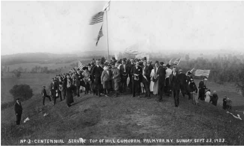
Centennial service on top of Hill Cumorah, Manchester, New York, September 23, 1923.