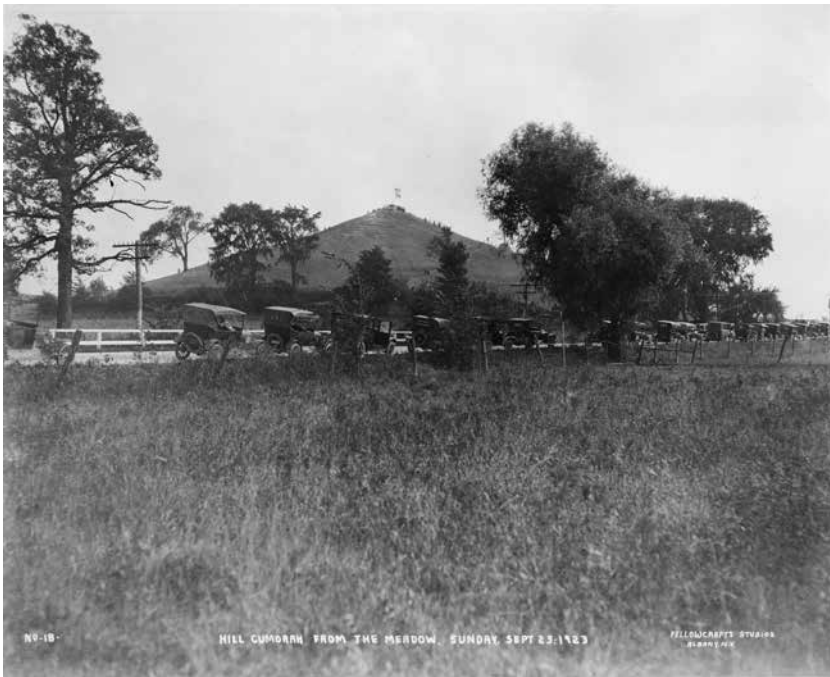
“Hill Cumorah from the Meadow” with automobiles in foreground, Manchester, New York, September 23, 1923.

Early September signaled the end of the Eastern States Mission’s summer proselyting campaign as its elders and sisters set their sights on the cradle of the Restoration. 68 All missionaries were instructed to arrive at the Joseph Smith family farm on September 21, 1923—not a day before, or a day after. Each companionship donned their personalized pennants as they traversed the highways and rail lines of the East Coast toward Upstate New York. Others walked—and kept on walking for several weeks—until they arrived. All told, over 150 elders and sisters made the journey to Palmyra. 69