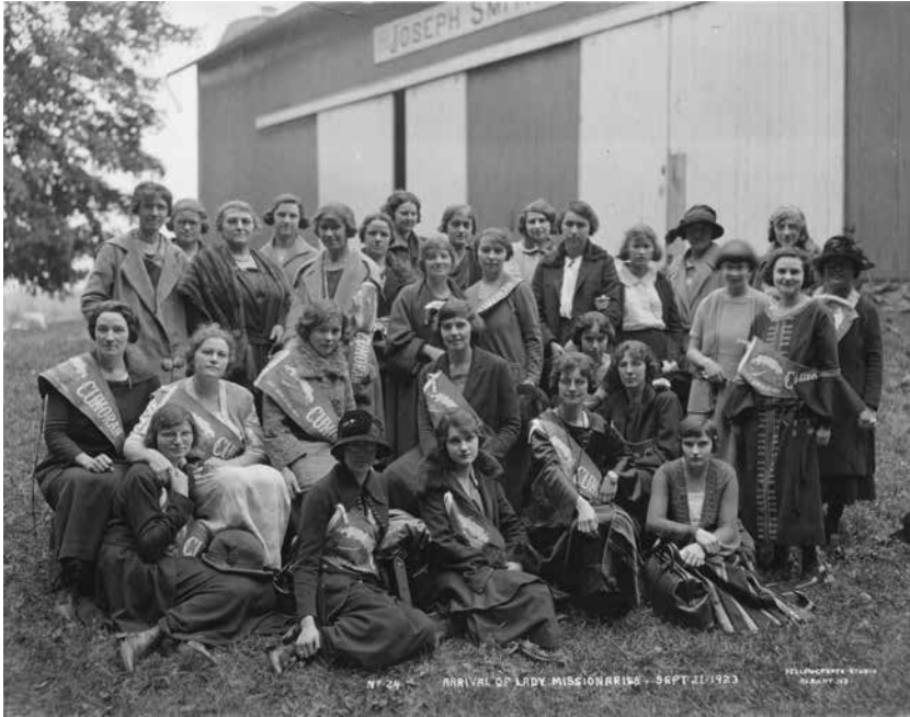
Arrival of lady missionaries at the Smith Farm, Palmyra, New York, September 21, 1923.