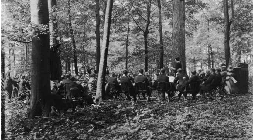
Sabbath service in the Sacred Grove, Palmyra, New York, September 23, 1923.

self-surrender, missionaries and leaders felt spiritually uplifted, renewed, and transformed in the place where the historical and contemporary churches met.