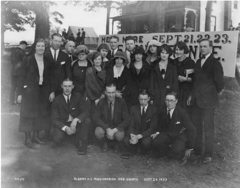
Eastern States missionaries and Saints from Albany, New York, in front of the Smith frame home, Palmyra, New York, September 24, 1923.

conference, we were happy that we were able to go home by train,” one elder recalled, “instead of having to retrace our steps by foot.” 120