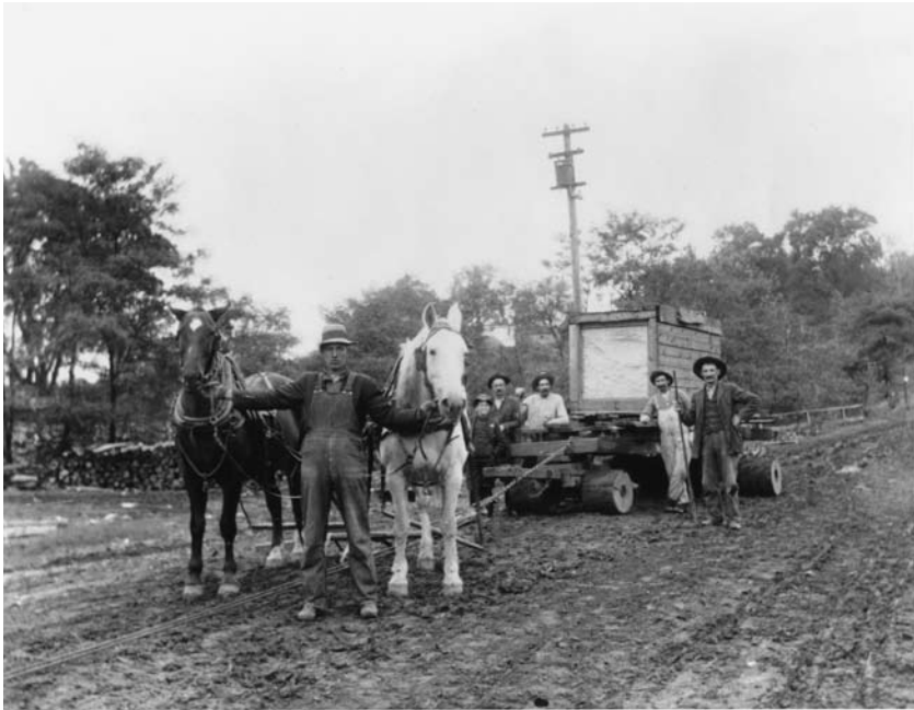
FIG. 6. Transporting the Oliver Cowdery Monument to cemetery from the railway, ca. November 1, 1911, Richmond, Missouri