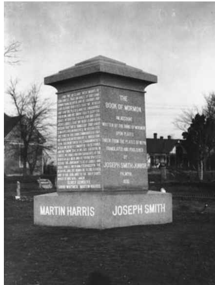
FIG. 7. Oliver Cowdery monument, November 21, 1911, Richmond, Missouri